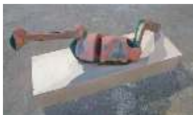
Lee Grandjean Two Shank Flank 2019 wood, plywood, steel mesh, scrim, cement, paint, varnish 123 x 40 x 38 cm