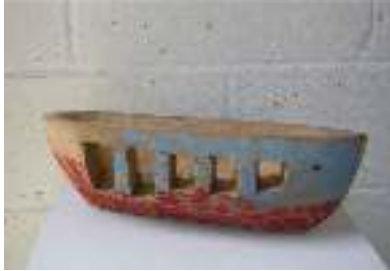
Richard Lawrence Boat 2019 wood, oak 12 x 32 x 10 cm