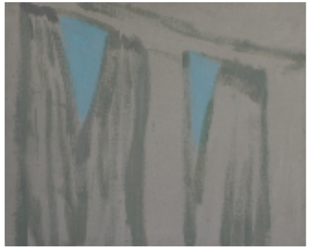
Robert Welch Pale Curtain 1999 acrylic on canvas 44 x 48 cm