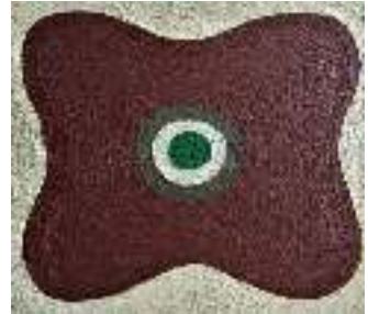
Geoffrey Rigden Henry Green 2000 acrylic on canvas 35 x 41 cm