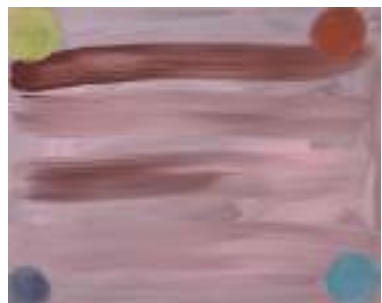
Mali Morris Settling 2008 acrylic on canvas 40 x 50 cm