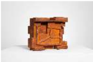
Jeff Lowe Taking Shape No.8 2013 cast iron 22.8 x 28 x 11.4 cm