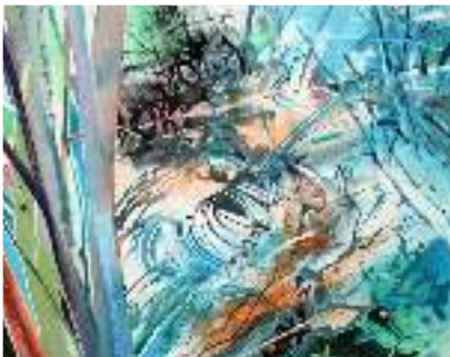
David Wiseman Where Glimmering Pebbles Lie 2019 acrylic on canvas 43 x 55 cm