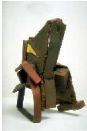
Stephen Lewis Cedan 1998 steel and brass 38 x 28 x 35 cm