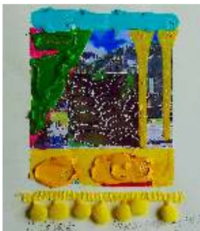
Stephen Cooper Il Colosso. Pensando alla Roma 2017 mixed media on paper 44 x 40 cm