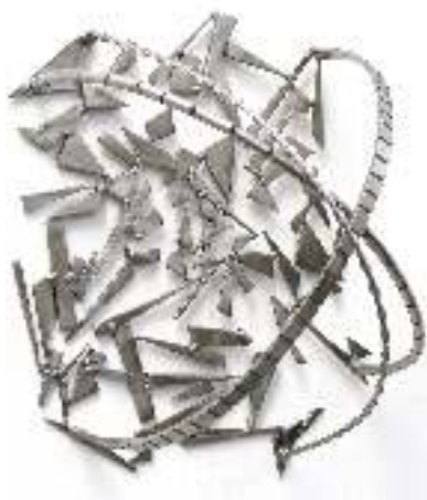
John Gibbons Symphony/Joy 2018 stainless steel, varnished 34.5 x 29 x 22 cm