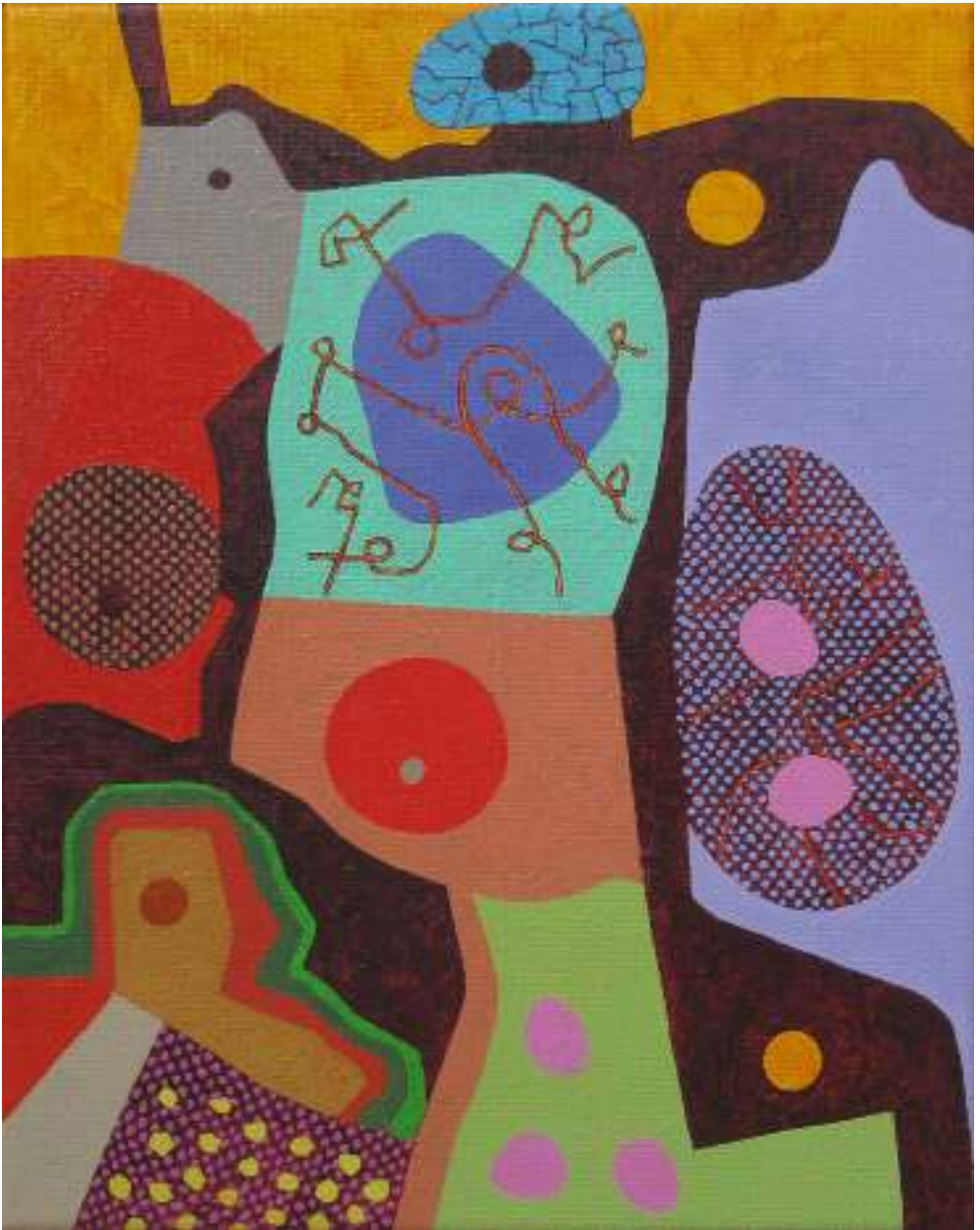
Clyde Hopkins It's a Shame about Ray 2017 oil on linen 25 x 20 cm