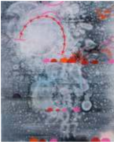
Virginia Verran Nightingale Structure (blue/grey) Alayrac 2016 oil and pigment on canvas on board 50 x 41 cm