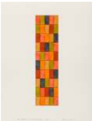
Trevor Sutton 50 Colours Ascendant 2013 watercolour on paper 34.5 x 26 cm